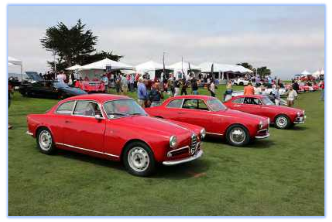
Alfa Sprints at Concorso Italiano, including a rare early Veloce 1300 with plexiglass side windows. The 32nd annual Concorso was held at Blackhorse/Bayonet golf course California, on August 19, 2017.