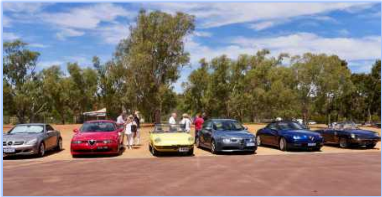
Cars line up opposite the hotel at New Norcia before lunch