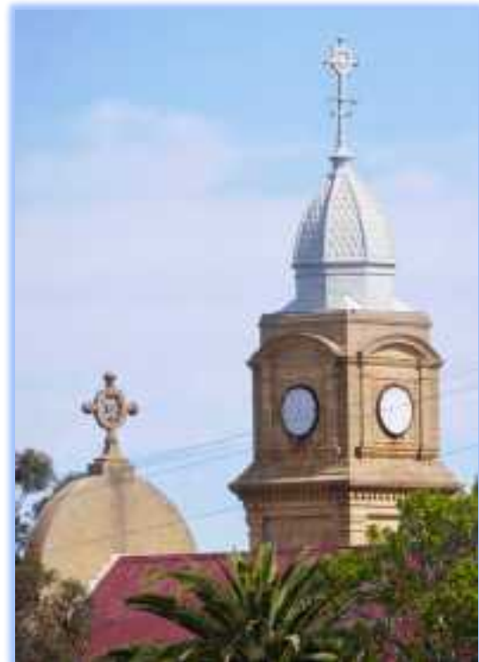
A walk around the Abbey and other buildings at New Norcia