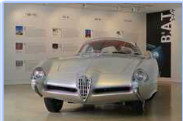
The B.A.T. 5 and B.A.T. 9 prototypes.