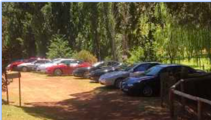
AROCA WA Alfas seen at this year's Vineyard Kitchen Christmas Lunch

and so it is a great opportunity for club members with concessionally registered cars to take their vehicles out for a run. Note that any one of these 3 rd Sunday runs may involve only one individual vehicle.