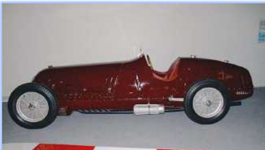
Alfa Romeo GP Tipo C 12 cylinders 1936 at the Alfa Museum is chassis 50012 modified to take a 12C 36 engine.