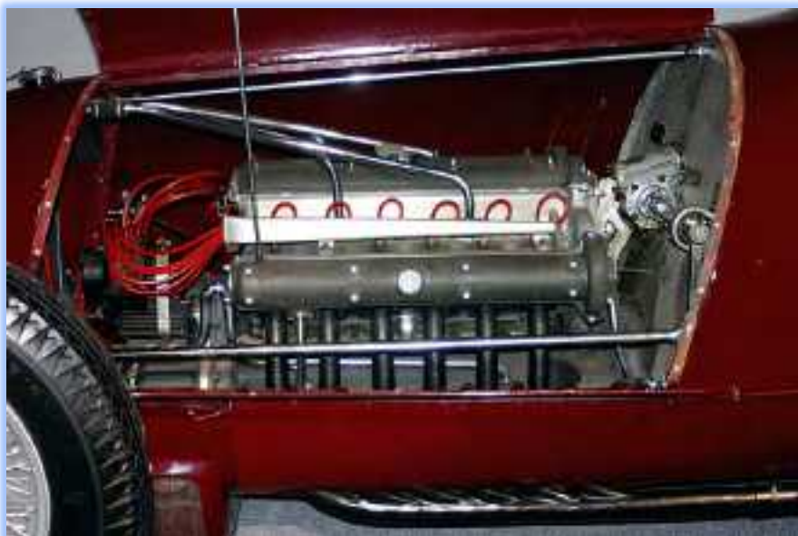
Tipo C 12 cylinder 1936 engine in chassis 50012.