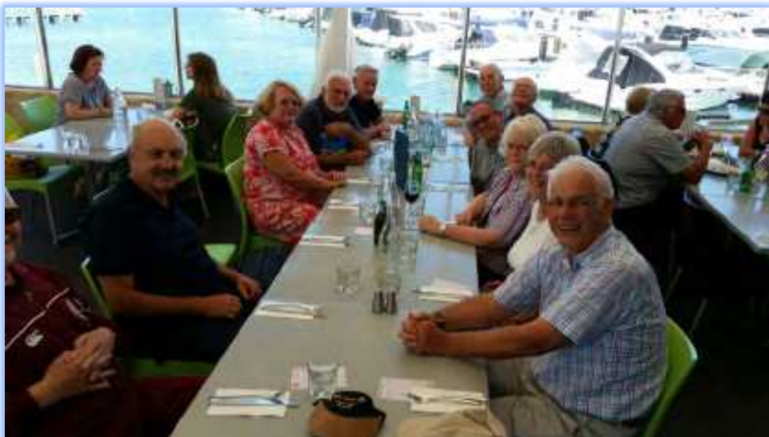
Mid-week run attendees lunching at Mia Cucina restaurant, Hillary's boat harbour.

The run comprised 120kms of bushland, farming, semi-rural and suburban roads with occasional opportunities to “blow-out some cobwebs”. Some of Perth’s northern coastal suburbs were visited; a few parts of which were new to these mid-week drivers. The 2-hour trip involved driving in beautiful weather, before meeting for lunch at “Mia Cucina” Restaurant at the Hillary’s boat harbour complex. Photos from this first mid-week run appear below.