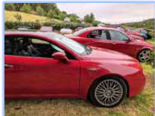
Some of Santa's red cars seen at the lunch