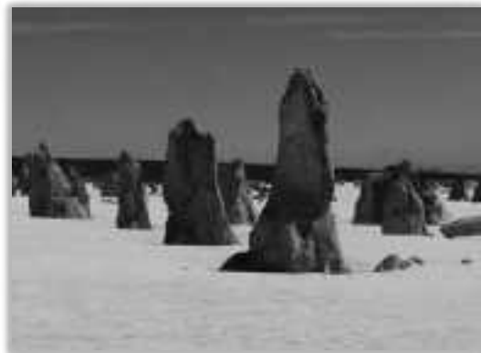
Above: The lobster platter at the Cervantes country club Scenes at the Pinnacles National Park