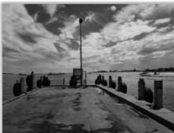
Adjacent: The pier at Jurien Bay. Rita Quinn's 105 seen en route.

Following our inspection of the motorbike collection, the group drove on to overnight accommodation at the Cervantes Pinnacle Motel.